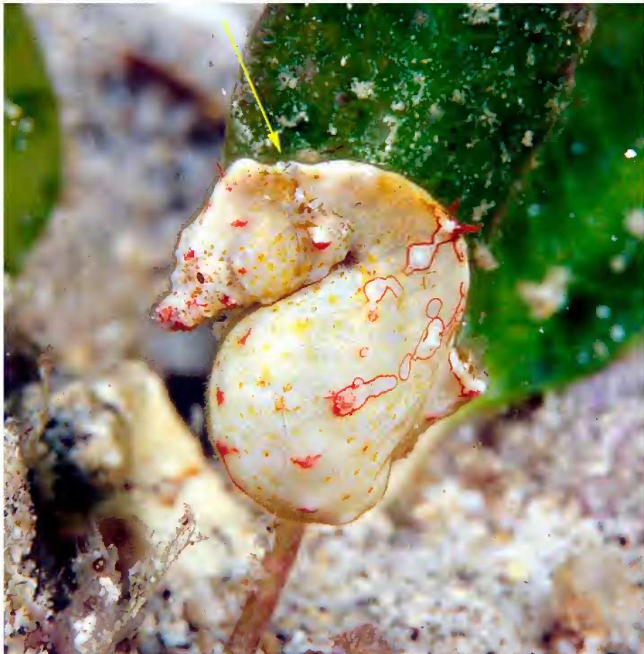
Fig. 3. Hippocampus colemani , this specimen not collected, sex not determined. The single gill opening is arrowed.